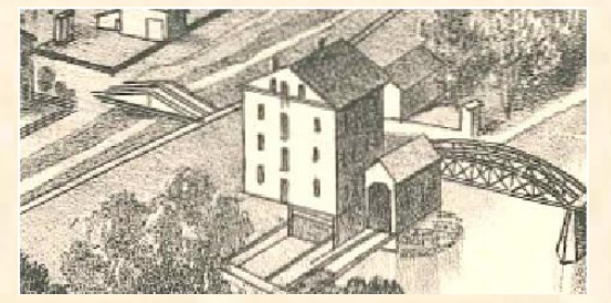
The 1834 mill, with canal on left and millrace and river on right. From 1876 map.

Until the great fire of 1877, the town's commercial district was confined to the two blocks south of the mill. Canal Street was no street—rather, the canal itself, running toward Sharon.