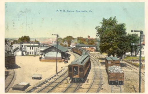
Pennsylvania (E & P) Rail Station with tracks of the Sharpsville Railroad to the right

Though a line just 17 miles long, the Sharpsville Railroad had a fascinating history. On its north end, stood the blast furnaces at Sharpsville; on its south end (before the line was extended to New Wilmington), lay the valuable block coal mines of Hickory and Bethel. The Erie & Pittsburgh for years had a monopoly on